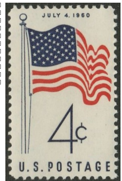
1960 50-star commemorative