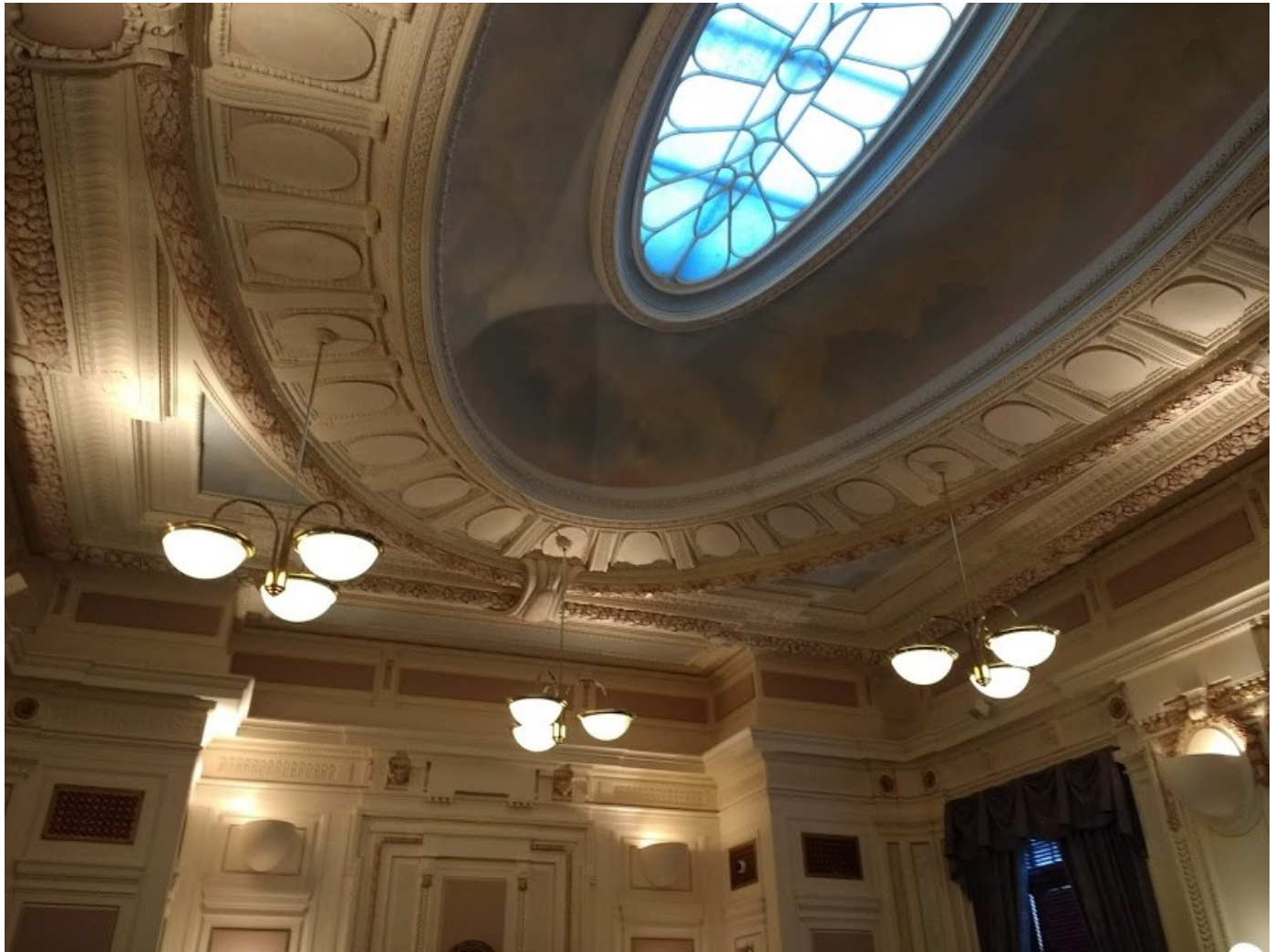
Ceiling of one of the ornate courtrooms