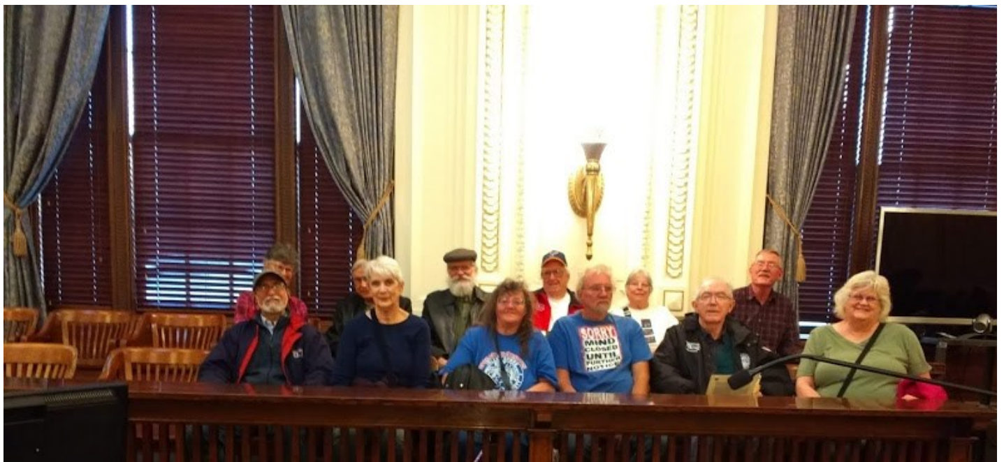
Group photo in the courtroom of the 12 members who attended the tour