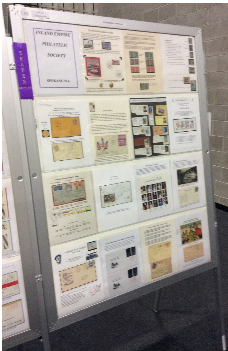
Our club won a ribbon for a one-frame exhibit at SEAPEX in September.