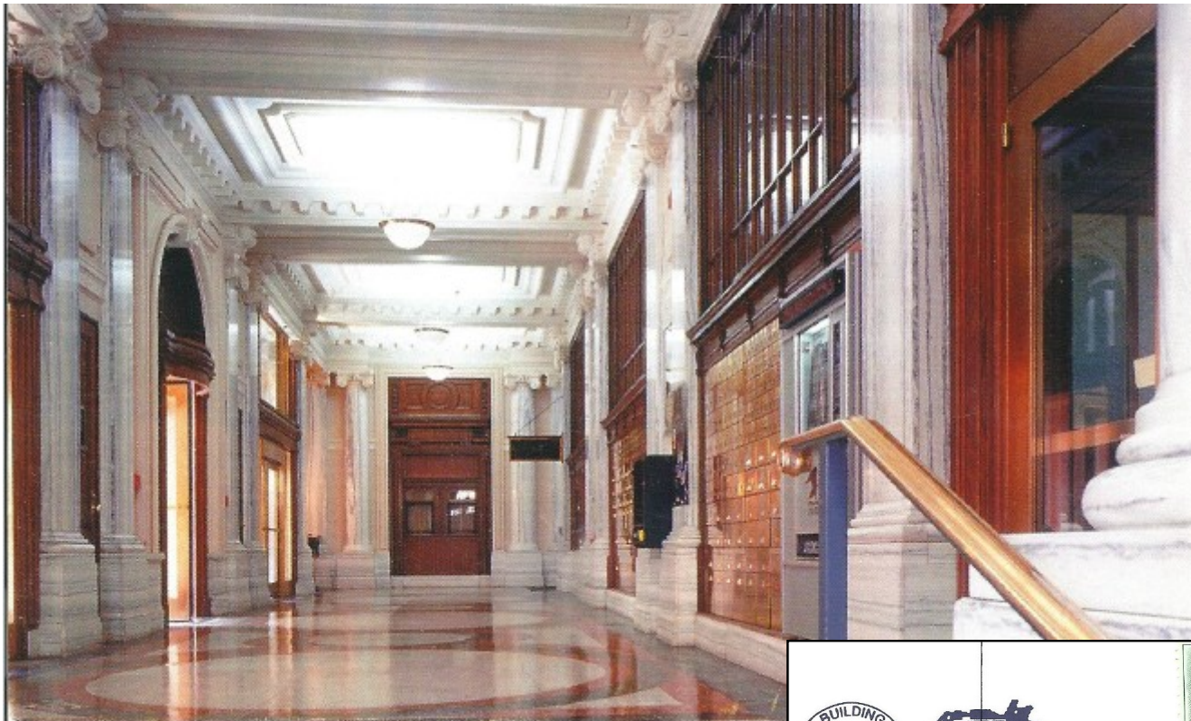
Post office lobby