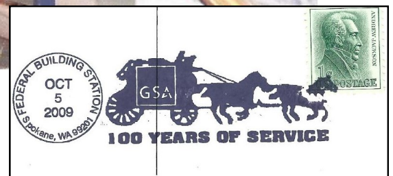
2009 100th-anniversary cancel